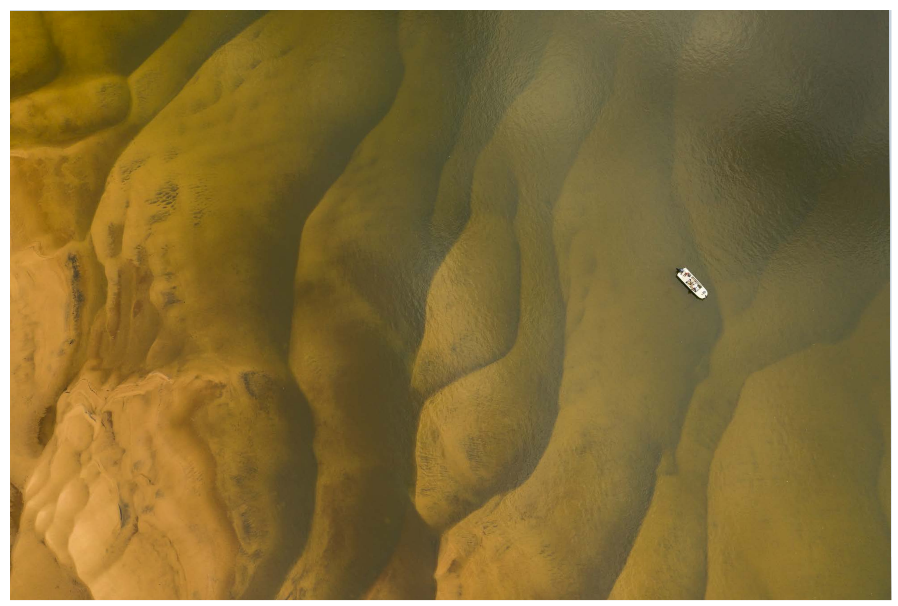
The sandbars are where the true excitement lies. When the conditions are right, colossal dorado hunt sabalo baitfish that seasonally congregate in big schools, resulting in massive boiling feeding frenzies in knee-deep water