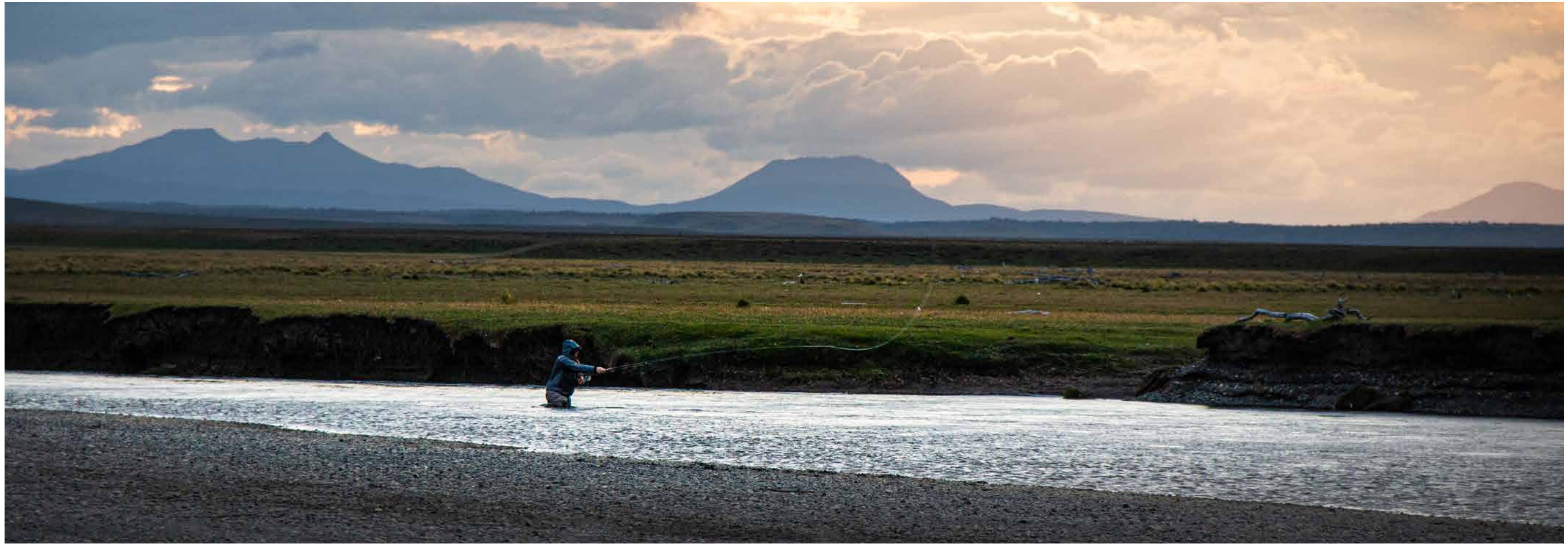
Kau Tapen is located on the heart of the Rio Grande, the most productive sea-run brown trout fishery in the world, and the easiest river you'll ever wade, with a gravel bottom and even flow.